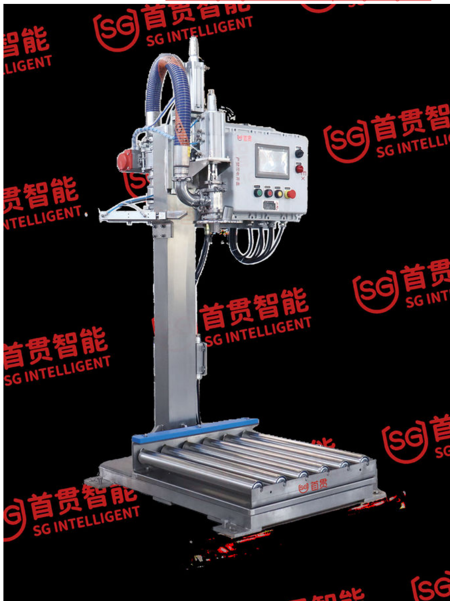
Ex 200L 200kg 150kg Motor Oil Chemical Liquid Weight Filling Machine